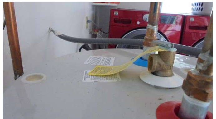
TPR valve is not plumbed